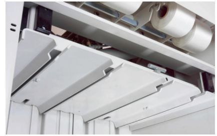
Massive press ram and extremely robust press plate guidance