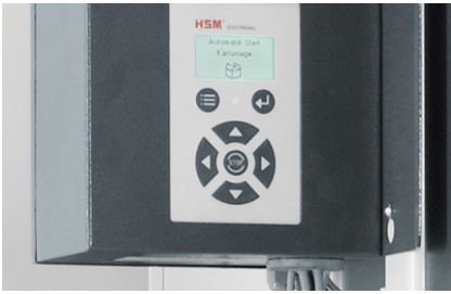
Convenient membrane keypad with text display, which shows the current status of the machine