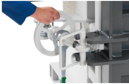
Hand wheel door lock - Easy to handle thanks to counter-rotating thread for quick opening and closing