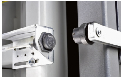
Automatic start of the pressing process after closing the door