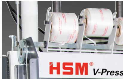
Manual bale strapping with continuous polyester tape