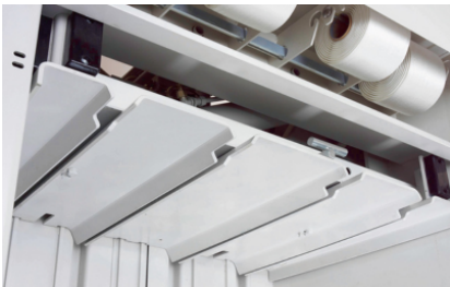
Massive press ram and extremely robust press plate guidance