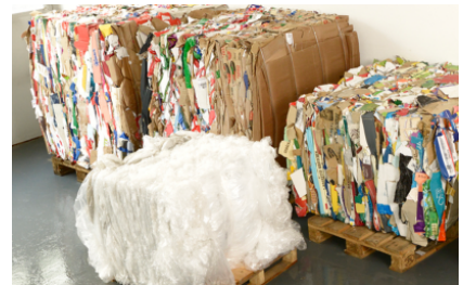
Suitable for cardboard as well as film