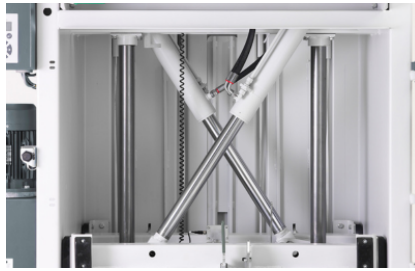
Quick and easy installation due to crossed cylinders