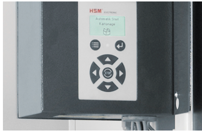
Convenient membrane keypad with text display, which shows the current status of the machine