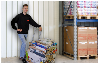
Bale removal and transport with discharge trolley