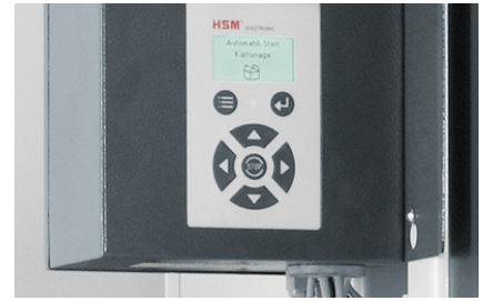
Convenient membrane keypad with text display, which shows the current status of the machine