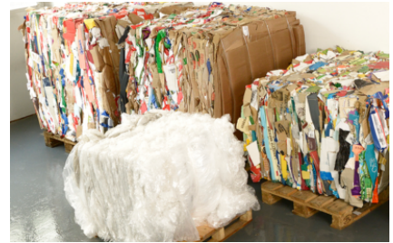
Suitable for cardboard as well as film