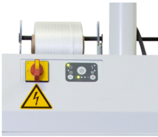
Microprocessor controller with membrane keypad