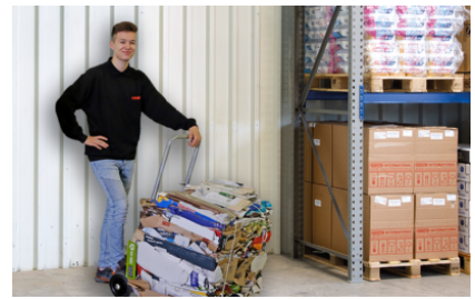
Bale removal and transport with discharge trolley