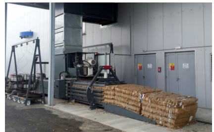
Suitable for almost all requirements. Contact us if you have other materials or applications. We will find you a suitable solution.