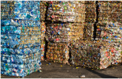
High compression and bale weights