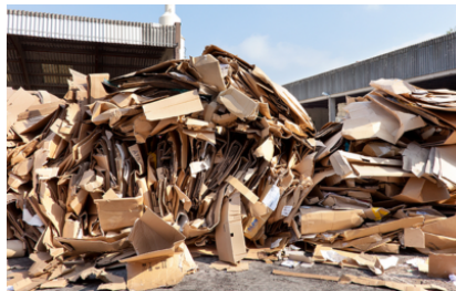
Versatile solution for materials up to approx. 60 kg /m 3 bulk weight