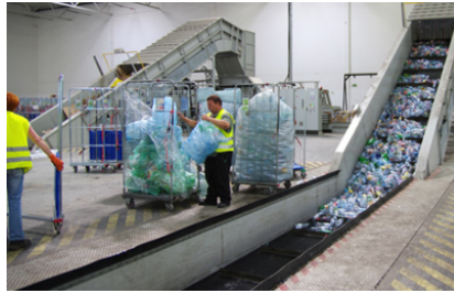
Suitable for continuous loading with conveyor belt, air feeding or similar