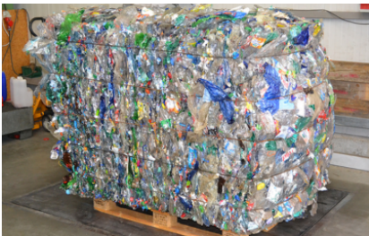
Particularly suitable for compression of PET bottles