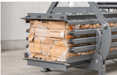
Suitable for compressing paper, cardboard, shredded material and plastic film