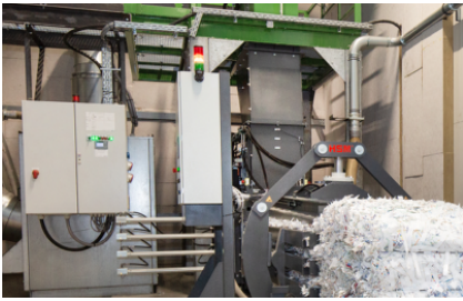
Suitable for continuous loading with conveyor belt, air feeding or similar