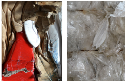
Particularly suitable for compression of cardboard and plastic film