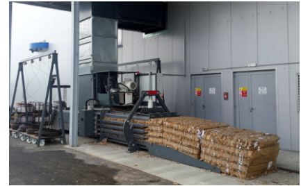
Suitable for almost all requirements. Contact us if you have other materials or applications. We will find you a suitable solution.