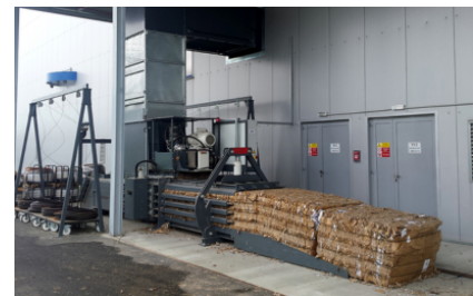
Suitable for almost all requirements. Contact us if you have other materials or applications. We will find you a suitable solution.