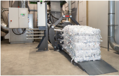
Integration into automated industrial production processes