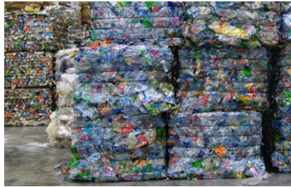
Compresses paper, cardboard, plastic film and PET bottles