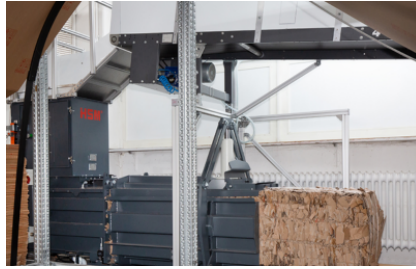
Integration into automated industrial production processes