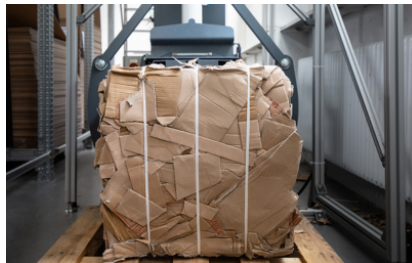
Available as an option with manual strapping