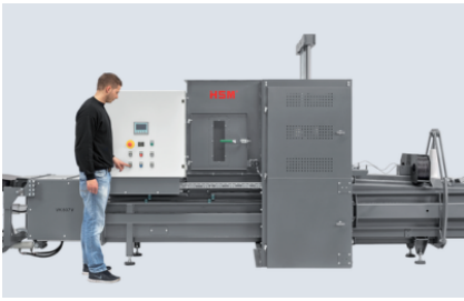
Operating side can be selected