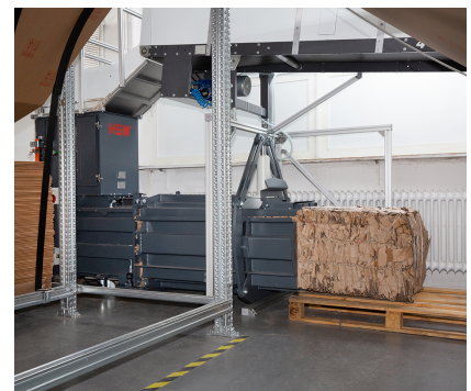
Integration into automated industrial production processes