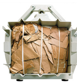
Manual bale strapping with continuous polyester tape