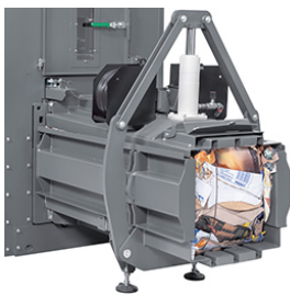
Mainly compresses cardboard and light paper