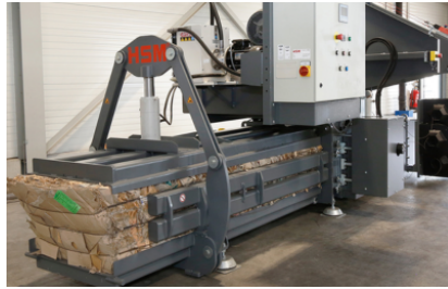
Very low space requirement thanks to compact and sturdy design