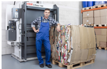
Optimised bale dimensions and bale weights for efficient storage, transport and direct commercialisation