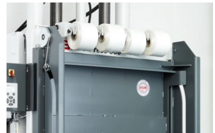
Strapping with wire - optional tape station available for strapping with polyester tape or wire according to requirements