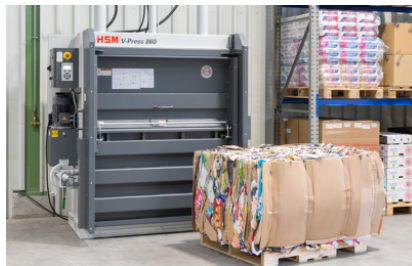
Produces particularly large, high density bales which can be sold with no further compression required