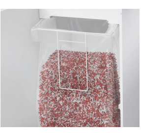
After opening the door, the removable, collecting bag can be easily removed and emptied.