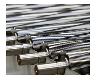
The induction-hardened, solid steel cutting rollers with a lifetime warranty can easily cope with staples and paper clips and guarantee durability.