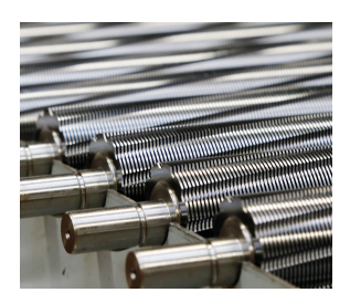
The induction-hardened, solid steel cutting rollers can easily cope with staples and paper clips and guarantee durability.