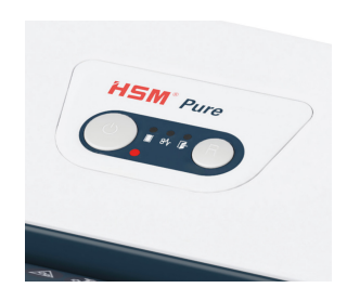
The full bin is indicated via the display and the machine switches off automatically.