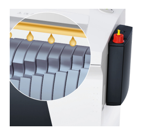
For a consistently high cutting performance, this low maintenance document shredder has an external automatic oiler as an option.