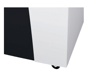
For convenience, there are castors on the document shredder so it is easy to move around.